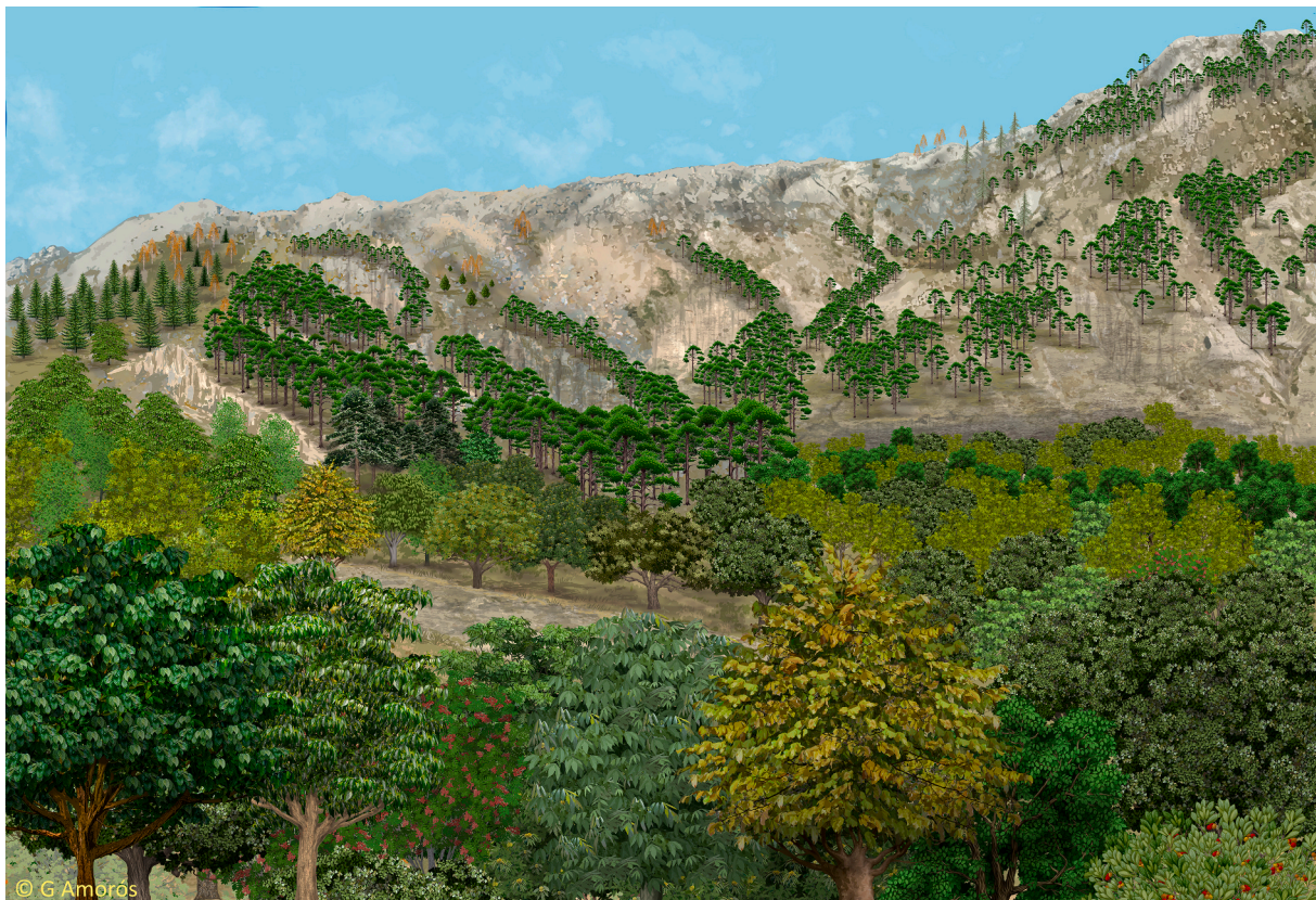
Fig. 6. Paleoartistic reconstruction of a glacial refuge for mesothermophilous plants located in an intramontane valley within the Betic Cordilleras surrounding the Guadix-Baza depression. This scenario embraces the period 1.6–1.2 Ma. Here we emphasise the coalescence in space and time of taxa with different ecological affinities in a climatic context where survival in hydroclimatic refuges would be the limiting chorological factor. Refuges may have been located at mid-altitudes, within what are now the supra and mesomediterranean vegetation belts. Pine forests dominate on rocky soils on steeper slopes, and angiosperms' greater density and arboreal diversity are seen within valley bottoms. The occurrence of genera such as Cathaya , Picea , Abies , Tsuga , Parrotia , Carya , Zelkova , Carpinus , Eucommia , Arbutus , Sorbus , Fagus , Acer , Juglans , Castanea , and Ulmus , among others, is worth mentioning.

actuo-ecological approach, we place the locally abundant Ephedra distachya in rocky areas and substrates with marl and gypsum (López-González, 1986).