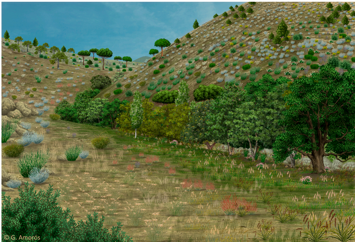
Fig. 5. Paleoartistic reconstruction of a riparian environment under arid conditions during a stadial phase of the Early Pleistocene in OAZ, such as inferred from the paleoecological record of VM1 around 1.6 Ma. A greater proliferation of trees is observed in areas influenced by the water table. There are also pines and oaks alongside the arboreal strata that make up the gallery forest. The locally abundant Ephedra is depicted in rocky areas and substrates with marl and gypsum. Halophytic communities are largely in the lower part of the drawing. Artemisia abounds in the rocky, treeless slopes.

modifying the outline. Again, this creates an implicit tension between style, physiognomy, and ecology, but in the study case, paleoart should not operate at the expense of scientific transmission. This choice also explains some decisions in colouration. For example, although obviously, not all chenopods exhibit betacyanins in their vegetative organs, nor throughout their life cycle, we have decided to colour them red as it is a very distinctive feature of the family that highlights its presence among the more xerophytic and halophytic communities of the region (Figs. 4 and 5).