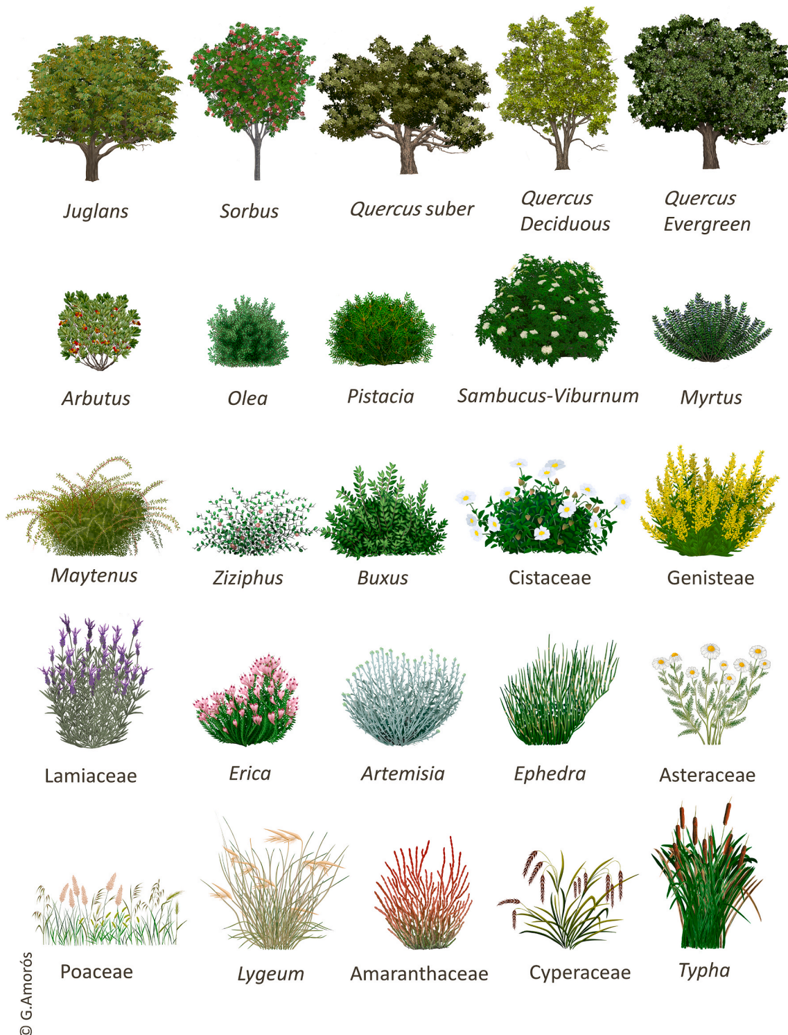
Fig. 3. Original digitised drawings depicting the primary taxa of the paleoartistic reconstruction of the Orce Archaeological Zone (OAZ) shown in Figs. 3–6 (part 2).

must have been therefore contingent on Early Pleistocene vegetation dynamics (Carrión et al., 2022a, b), although there are latitudinal differences including denser forest formations in the northeast, and arid lands in the south (Suc and Cravatte, 1982; Leroy, 1987, 1988, 1997; Postigo-Mijarra et al., 2007; Jimenez-Moreno et al., 2010; Altolaguirre et al., 2019). Several cases of survival are particularly relevant, such as Carpinus betulus , which might have its last refuge in the Betics before retreating to positions that today are confined to the Eurosiberian belt (Ochando et al., 2022b). Their illustration in this study attempts to