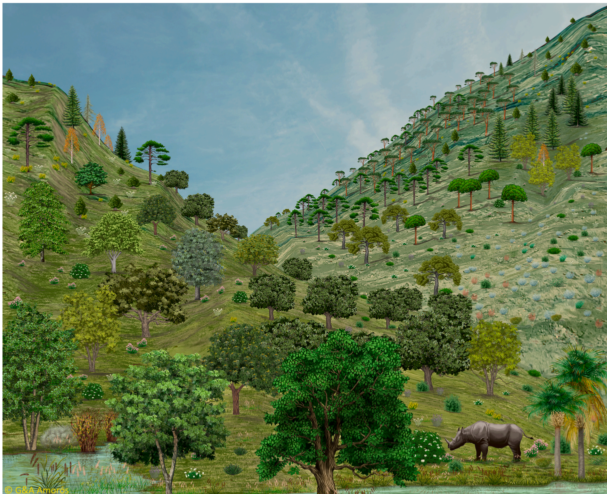
Fig. 4. Paleoartistic reconstruction that, regardless of the climatic phase, summarises the main taxa and vegetation types of the Early Pleistocene (1.6–1.2 Ma) inferred from palynological findings in VM1, BL, and FN3, Orce Archaeological Zone (OAZ). It includes altitudinal gradients culminating in conifers and birches above deciduous forest belts, areas with deeper soils in valleys dominated by woody angiosperms, and finally lacustrine and riparian environments at the bottom with meadows, sedge communities, and phreatophytes. The rhinoceros (bottom right) symbolises the importance of herbivory in the heliophytism of Pleistocene forests in the region.

After painting the taxonomic elements selected (Figs. 2 and 3) using the methods in Amorós (2023), four paleolandscape digital paintings were created (Figs. 4–7). Obviously, numerous artistic styles can potentially illustrate a plant community in space. Our choice has been to reduce some realism to gain taxonomic prominence while simultaneously addressing the geobotanical landscape synoptically. A drawing attempting photorealism could generate an image too homogenous in shapes and colours to discriminate between plant species, genera, and families. To the extent possible, we have tried to include identifying features that provide contrast, such as fruits ( Sorbus , Arbutus , Salix , Castanea , Myrtus , Pistacia , Cyperaceae), flowers and inflorescences (Asteraceae, Artemisia , Lamiaceae type Lavandula , Cistaceae, Genisteae, Typha , Erica , Sambucus-Viburnum ), sparse groups of deciduous leaves ( Betula , Juglans , Acer , Parrotia , Corylus , Populus ), or even growth habits with certain “cultural” concessions (e.g., anthropic forests), which likely do not correspond to the wild morphotypes but facilitate visual discrimination. We are aware that this style may also produce phenological distortions (e.g., overlapping marcescent phases in some species with foliage phases in others). With the same goal, the drawings tend to isolate each plant individual of each taxon without substantially